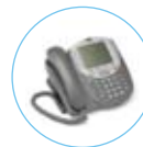
56xx, 64xx, 84xx series, Quick Edition