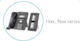
16xx, 96xx series