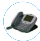
24xx, 46xx (except 4606, 4612), 54xx