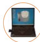
Softphone IP Soft phone (no hook switch control support for IP Office System)