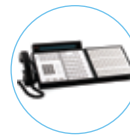
4606, 4612, 4624 series Index 2010, 2030, 2050, 2060